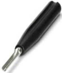
Positioning and contact removal tool for RC crimp contacts for pin / socket, diameter 1 mm

Please be informed that the data shown in this PDF Document is generated from our Online Catalog. Please find the complete data in the user's documentation. Our General Terms of Use for Downloads are valid ( http://phoenixcontact.com/download )