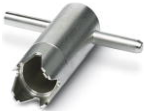
Special pipe wrench, tool for mounting the M23 coupler connector housing for assembly

Please be informed that the data shown in this PDF Document is generated from our Online Catalog. Please find the complete data in the user's documentation. Our General Terms of Use for Downloads are valid ( http://phoenixcontact.com/download )