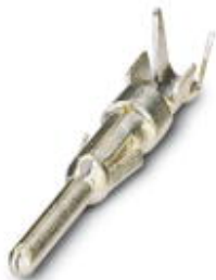
Crimp contact, rolled, Single contact, contact diameter: 1 mm, crimp range: 0.22 mm 2 ... 0.56 mm 2

Please be informed that the data shown in this PDF Document is generated from our Online Catalog. Please find the complete data in the user's documentation. Our General Terms of Use for Downloads are valid ( http://phoenixcontact.com/download )