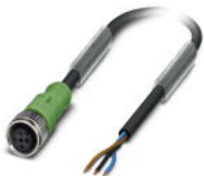
Sensor/actuator cable, 3-position, PUR halogen-free, black-gray RAL 7021, free cable end, on Socket straight M12, coding: A, cable length: 12 m

Please be informed that the data shown in this PDF Document is generated from our Online Catalog. Please find the complete data in the user's documentation. Our General Terms of Use for Downloads are valid ( http://phoenixcontact.com/download )