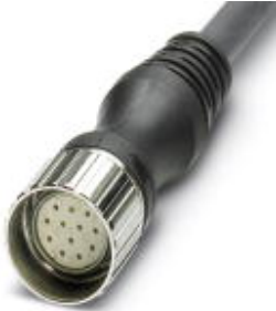
Socket M23, straight, 12-pos., with 20 m master cable

Please be informed that the data shown in this PDF Document is generated from our Online Catalog. Please find the complete data in the user's documentation. Our General Terms of Use for Downloads are valid ( http://phoenixcontact.com/download )