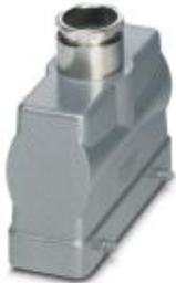
HEAVYCON B24 sleeve housing, for double locking latch, height: 76 mm, with 1 x Pg29 screw connection, straight cable outlet

Please be informed that the data shown in this PDF Document is generated from our Online Catalog. Please find the complete data in the user's documentation. Our General Terms of Use for Downloads are valid ( http://phoenixcontact.com/download )