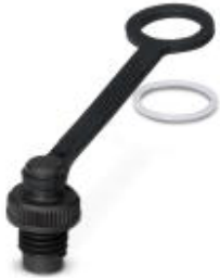
M8 sealing cap made of plastic with fixing band, for free M8 sockets, with 11.5 mm fastening eye

Please be informed that the data shown in this PDF Document is generated from our Online Catalog. Please find the complete data in the user's documentation. Our General Terms of Use for Downloads are valid ( http://phoenixcontact.com/download )