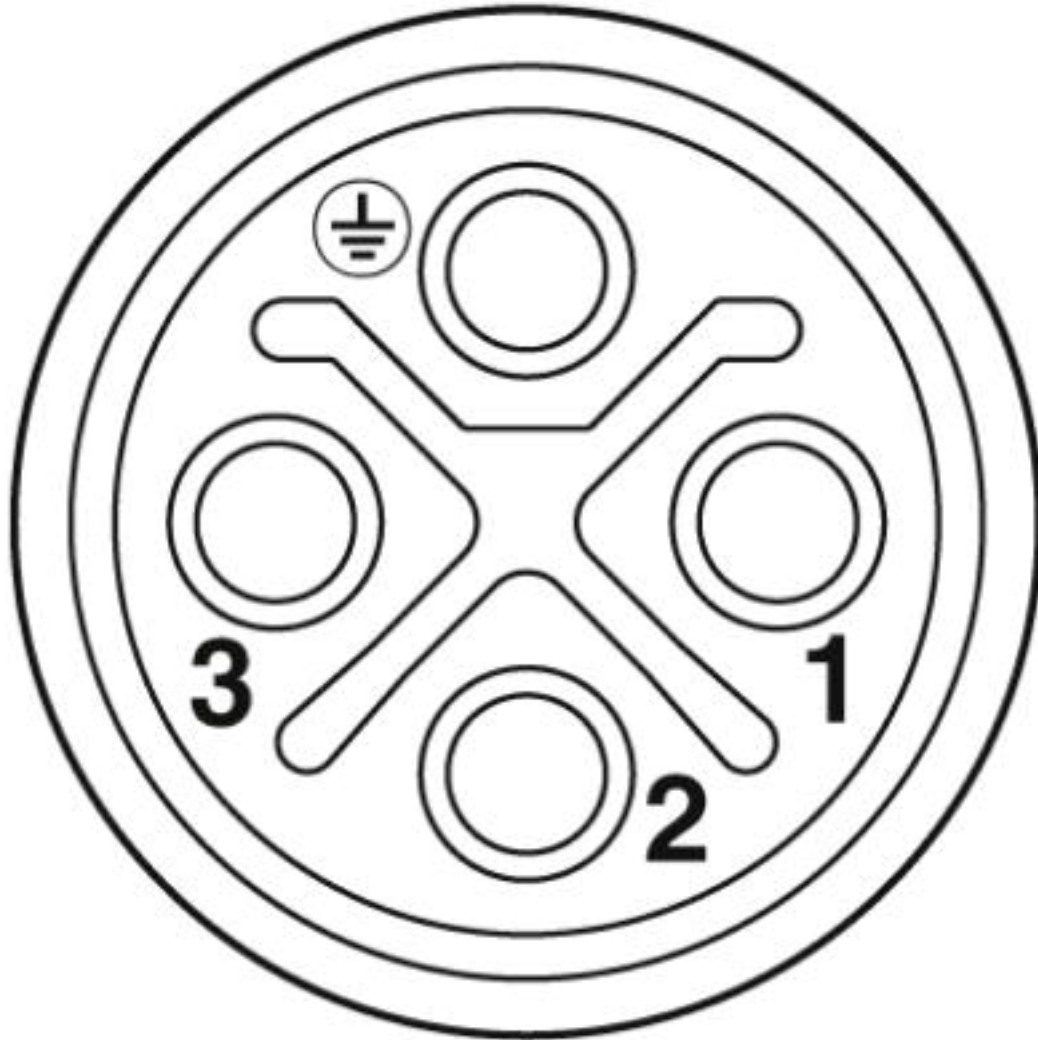
Pin assignment of M12 socket, 4-pos., S-coded, socket side view