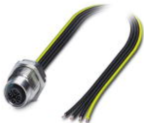
Flush-type connector, Power, 4-position, Socket, M12, S power, Rear mounting, M16 x 1.5, Individual wires, cable length: 0.5 m, 1.31 mm 2 , UL/cUL stranded hook-up wire

Please be informed that the data shown in this PDF Document is generated from our Online Catalog. Please find the complete data in the user's documentation. Our General Terms of Use for Downloads are valid ( http://phoenixcontact.com/download )