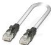
Patch cable, CAT5, assembled, 5 m

Patch cable - FL CAT5 PATCH 5,0 - 2832580