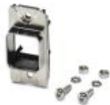
RJ45 panel mounting frame for transceiver, IP67, for push-pull interlocking, metal, for square mounting cutout, with seal and mounting screws

Panel mounting frames - FOC-V14-F1ZNI-EM/SJO - 1413981