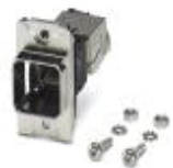
RJ45 panel mounting frame, IP67, for push-pull interlocking, metal, for rectangular mounting cutout, with seal and mounting screws, incl. RJ45 insert with IDC cable connection

Panel mounting frames - CUC-V14-F1ZNI-EM/R4F8 - 1413961