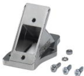
45° adapter for panel mounting frames

Please be informed that the data shown in this PDF Document is generated from our Online Catalog. Please find the complete data in the user's documentation. Our General Terms of Use for Downloads are valid ( http://phoenixcontact.com/download )