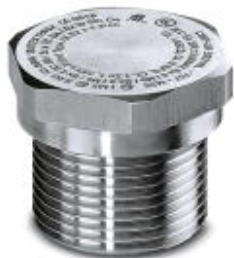
Screw plug, cable gland material: Stainless steel 316L, application: Ex, connecting thread: M25 x 1.5, color: silver

Please be informed that the data shown in this PDF Document is generated from our Online Catalog. Please find the complete data in the user's documentation. Our General Terms of Use for Downloads are valid ( http://phoenixcontact.com/download )