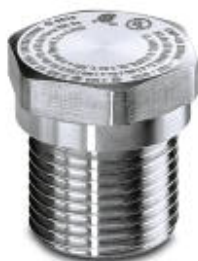
Screw plug, cable gland material: Stainless steel 316L, application: Ex, connecting thread: M20 x 1.5, color: silver

Please be informed that the data shown in this PDF Document is generated from our Online Catalog. Please find the complete data in the user's documentation. Our General Terms of Use for Downloads are valid ( http://phoenixcontact.com/download )