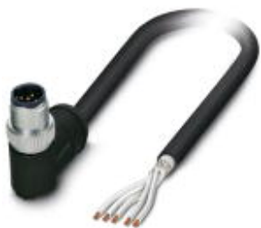
Sensor/actuator cable, 5-position, PE-X halogen-free, black, shielded, Plug angled M12 SPEEDCON, coding: A, on free cable end, cable length: 10 m, For railway applications

Please be informed that the data shown in this PDF Document is generated from our Online Catalog. Please find the complete data in the user's documentation. Our General Terms of Use for Downloads are valid ( http://phoenixcontact.com/download )