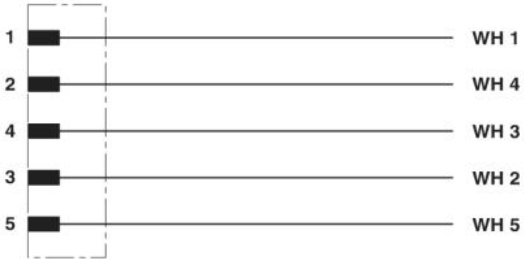
Contact assignment of the M12 plug