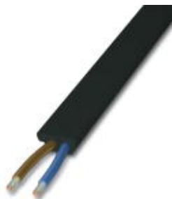
AS-Interface PVC flat conductor with UL in black, for additional power supply, 2 x 1.5 mm 2 , 1000 m on an one-way drum

Please be informed that the data shown in this PDF Document is generated from our Online Catalog. Please find the complete data in the user's documentation. Our General Terms of Use for Downloads are valid ( http://phoenixcontact.com/download )