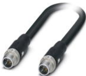
Assembled Ethernet cable, CAT5e, shielded, 8-wire, 4 x 26 AWG (data) and 4 x 20 AWG (power), RAL 9005 (black), M12 hybrid plug to M12 hybrid plug, length: 10.0 m

Please be informed that the data shown in this PDF Document is generated from our Online Catalog. Please find the complete data in the user's documentation. Our General Terms of Use for Downloads are valid ( http://download.phoenixcontact.com )