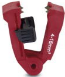
Replacement blade for WIREFOX 16, for cables and conductors of 4 - 16 mm 2

Please be informed that the data shown in this PDF Document is generated from our Online Catalog. Please find the complete data in the user's documentation. Our General Terms of Use for Downloads are valid ( http://phoenixcontact.com/download )