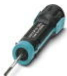
Assembly tool, for CK 1.6... crimp contacts for small conductor cross sections

Assembly tool - UNIFOX MT-CK 1.6/2.5 - 1089092