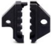
Spare die for CRIMPFOX-TC 4

Replacement die - CRIMPFOX-TC 4/DIE - 1212295