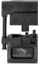
Die, for Crimpfox-M, for unshielded RJ11 connectors, packed in a serial storage box

Please be informed that the data shown in this PDF Document is generated from our Online Catalog. Please find the complete data in the user's documentation. Our General Terms of Use for Downloads are valid ( http://phoenixcontact.com/download )