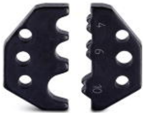
Spare die for CRIMPFOX-RC 10

Please be informed that the data shown in this PDF Document is generated from our Online Catalog. Please find the complete data in the user's documentation. Our General Terms of Use for Downloads are valid ( http://phoenixcontact.com/download )