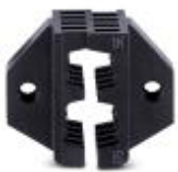
Spare die, for CRIMPFOX 50R

Replacement die - CRIMPFOX 50R/DIE - 1212042