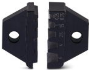
Spare die for CRIMPFOX 6

Please be informed that the data shown in this PDF Document is generated from our Online Catalog. Please find the complete data in the user's documentation. Our General Terms of Use for Downloads are valid ( http://phoenixcontact.com/download )