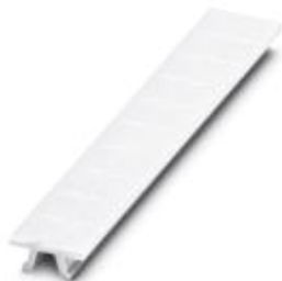
Zack marker strip, 10-section, horizontally labeled with the identical number: 34, white, width: 6 mm

Please be informed that the data shown in this PDF Document is generated from our Online Catalog. Please find the complete data in the user's documentation. Our General Terms of Use for Downloads are valid ( http://phoenixcontact.com/download )