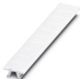
Zack marker strip, 10-section, vertically labeled with the consecutive numbers: 161 ... 170, white, width: 6 mm

Please be informed that the data shown in this PDF Document is generated from our Online Catalog. Please find the complete data in the user's documentation. Our General Terms of Use for Downloads are valid ( http://phoenixcontact.com/download )