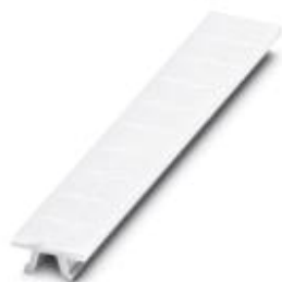
Zack marker strip, 10-section, vertically labeled with the consecutive numbers: 81 ... 90, white, width: 6 mm

Please be informed that the data shown in this PDF Document is generated from our Online Catalog. Please find the complete data in the user's documentation. Our General Terms of Use for Downloads are valid ( http://phoenixcontact.com/download )