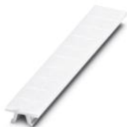
Zack marker strip, 10-section, horizontally labeled with the consecutive numbers: 421 ... 430, white, width: 6 mm

Please be informed that the data shown in this PDF Document is generated from our Online Catalog. Please find the complete data in the user's documentation. Our General Terms of Use for Downloads are valid ( http://phoenixcontact.com/download )