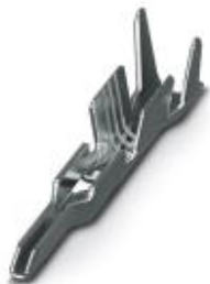
Crimp contact, type of contact: Male connector, connection method: Crimp connection, contact surface: Tin

Please be informed that the data shown in this PDF Document is generated from our Online Catalog. Please find the complete data in the user's documentation. Our General Terms of Use for Downloads are valid ( http://phoenixcontact.com/download )