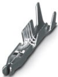
Crimp contact, type of contact: Female connector, connection method: Crimp connection, contact surface: Tin

Please be informed that the data shown in this PDF Document is generated from our Online Catalog. Please find the complete data in the user's documentation. Our General Terms of Use for Downloads are valid ( http://phoenixcontact.com/download )