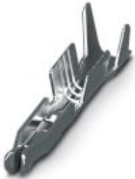
Crimp contact, type of contact: Female connector, connection method: Crimp connection, contact surface: Tin

Please be informed that the data shown in this PDF Document is generated from our Online Catalog. Please find the complete data in the user's documentation. Our General Terms of Use for Downloads are valid ( http://phoenixcontact.com/download )