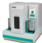
Laser marker incl. extraction unit, includes operating instructions, declaration of conformity, LS adapter plate, type E and F power cables, LAN cable, D-SUB cable 25-pos., suction tube, crevice nozzle set and filter equipment

Laser marker - TOPMARK NEO SET - 1012018