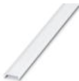
Cover, transparent, unlabeled, lettering field size: 1000 x 15 mm

Cover - CARRIER-EMP (1000X15) COVER - 0829520