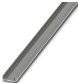
Profile, self-adhesive, 1000 mm long, for accommodating UC and US materials, height: 15 mm

Please be informed that the data shown in this PDF Document is generated from our Online Catalog. Please find the complete data in the user's documentation. Our General Terms of Use for Downloads are valid ( http://phoenixcontact.com/download )