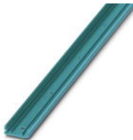
Marker carriers, transparent, unlabeled, mounting type: Screws, rivets, lettering field size: 1000 x 15 mm

Please be informed that the data shown in this PDF Document is generated from our Online Catalog. Please find the complete data in the user's documentation. Our General Terms of Use for Downloads are valid ( http://phoenixcontact.com/download )