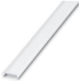
Cover, transparent, unlabeled, lettering field size: 1000 x 15 mm

Please be informed that the data shown in this PDF Document is generated from our Online Catalog. Please find the complete data in the user's documentation. Our General Terms of Use for Downloads are valid ( http://phoenixcontact.com/download )