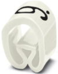
Conductor marking collar, Labeled with the number: Numbers, white, width: 3.2 mm

Please be informed that the data shown in this PDF Document is generated from our Online Catalog. Please find the complete data in the user's documentation. Our General Terms of Use for Downloads are valid ( http://phoenixcontact.com/download )