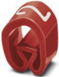
Conductor marking collar, Labeled with the number: Numbers, red, width: 3.2 mm

Please be informed that the data shown in this PDF Document is generated from our Online Catalog. Please find the complete data in the user's documentation. Our General Terms of Use for Downloads are valid ( http://phoenixcontact.com/download )