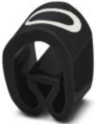
Conductor marking collar, Labeled with the number: Numbers, black, width: 3.2 mm

Please be informed that the data shown in this PDF Document is generated from our Online Catalog. Please find the complete data in the user's documentation. Our General Terms of Use for Downloads are valid ( http://phoenixcontact.com/download )