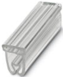
Marker carriers, transparent, Unlabeled, Mounting type: Slide on, Cable diameter: 4-10 mm, Lettering field: 18 x 4.2 mm

Please be informed that the data shown in this PDF Document is generated from our Online Catalog. Please find the complete data in the user's documentation. Our General Terms of Use for Downloads are valid ( http://download.phoenixcontact.com )