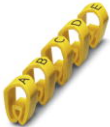
Conductor marking collar, labeled with the capital letter: Letters, white, width: 6.2 mm

Please be informed that the data shown in this PDF Document is generated from our Online Catalog. Please find the complete data in the user's documentation. Our General Terms of Use for Downloads are valid ( http://phoenixcontact.com/download )