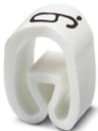
Conductor marking collar, Labeled with the number: Numbers, white, width: 4.2 mm

Please be informed that the data shown in this PDF Document is generated from our Online Catalog. Please find the complete data in the user's documentation. Our General Terms of Use for Downloads are valid ( http://phoenixcontact.com/download )