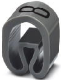
Conductor marking collar, Labeled with the number: Numbers, gray, width: 4.2 mm

Please be informed that the data shown in this PDF Document is generated from our Online Catalog. Please find the complete data in the user's documentation. Our General Terms of Use for Downloads are valid ( http://phoenixcontact.com/download )