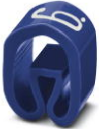
Conductor marking collar, Labeled with the number: Numbers, blue, width: 4.2 mm

Please be informed that the data shown in this PDF Document is generated from our Online Catalog. Please find the complete data in the user's documentation. Our General Terms of Use for Downloads are valid ( http://phoenixcontact.com/download )