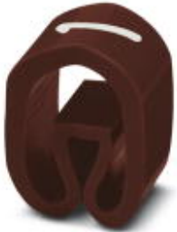
Conductor marking collar, Labeled with the number: Numbers, brown, width: 4.2 mm

Please be informed that the data shown in this PDF Document is generated from our Online Catalog. Please find the complete data in the user's documentation. Our General Terms of Use for Downloads are valid ( http://phoenixcontact.com/download )