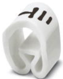
Conductor marking collar, labeled with the symbol: Symbols, white, width: 3.2 mm

Please be informed that the data shown in this PDF Document is generated from our Online Catalog. Please find the complete data in the user's documentation. Our General Terms of Use for Downloads are valid ( http://phoenixcontact.com/download )