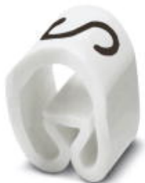
Conductor marking collar, labeled with the capital letter: Letters, white, width: 3.2 mm

Please be informed that the data shown in this PDF Document is generated from our Online Catalog. Please find the complete data in the user's documentation. Our General Terms of Use for Downloads are valid ( http://phoenixcontact.com/download )