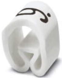
Conductor marking collar, Labeled with the number: Numbers, white, width: 3.2 mm

Please be informed that the data shown in this PDF Document is generated from our Online Catalog. Please find the complete data in the user's documentation. Our General Terms of Use for Downloads are valid ( http://phoenixcontact.com/download )