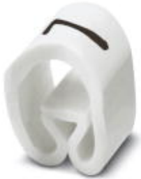
Conductor marking collar, Labeled with the number: Numbers, white, width: 3.2 mm

Please be informed that the data shown in this PDF Document is generated from our Online Catalog. Please find the complete data in the user's documentation. Our General Terms of Use for Downloads are valid ( http://phoenixcontact.com/download )