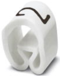
Conductor marking collar, Labeled with the number: Numbers, white, width: 3.2 mm

Please be informed that the data shown in this PDF Document is generated from our Online Catalog. Please find the complete data in the user's documentation. Our General Terms of Use for Downloads are valid ( http://phoenixcontact.com/download )