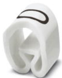
Conductor marking collar, Labeled with the number: Numbers, white, width: 3.2 mm

Please be informed that the data shown in this PDF Document is generated from our Online Catalog. Please find the complete data in the user's documentation. Our General Terms of Use for Downloads are valid ( http://phoenixcontact.com/download )