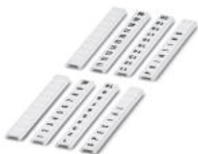
Zack marker strip flat, 10-section, horizontally labeled with the consecutive numbers: 131 ... 140, white

Please be informed that the data shown in this PDF Document is generated from our Online Catalog. Please find the complete data in the user's documentation. Our General Terms of Use for Downloads are valid ( http://phoenixcontact.com/download )