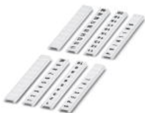
Zack marker strip flat, 10-section, horizontally labeled with the consecutive numbers: 81 ... 90, white

Please be informed that the data shown in this PDF Document is generated from our Online Catalog. Please find the complete data in the user's documentation. Our General Terms of Use for Downloads are valid ( http://phoenixcontact.com/download )