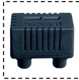
Capacitance Ext Module